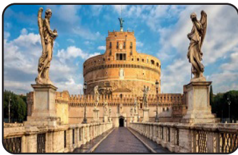
Castel Sant'Angelo National Museum

Rome the Eternal City, is the capital and largest city of Italy and of the Lazio region. It is famous for being the home of the ancient Roman Empire, the Seven Hills, La Dolce Vita (the sweet life), the Vatican City and Three Coins in the Fountain. Rome, as a millennia long center of power, culture (having been the cradle of one of the globe's greatest civilization's ever) and religion, has exerted a huge influence over the world in its roughly 2800 years of existence. The historic center of the city is a UNESCO World Heritage Site. With wonderful palaces, thousand-year-old churches, grand Romantic ruins, opulent monuments, ornate statues and graceful fountains, Rome has an immensely rich historical heritage and cosmopolitan atmosphere, making it one of Europe's and the world's most visited, famous, influential and beautiful capitals. Today, Rome has a growing nightlife scene and is also seen as a shopping heaven, being regarded as one of the fashion capitals of the world (some of Italy's oldest jewellery and clothing establishments were founded in the city).