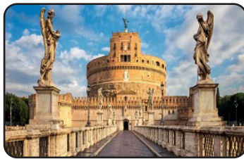
Castel Sant'Angelo National Museum

Rome the Eternal City, is the capital and largest city of Italy and of the Lazio region. It is famous for being the home of the ancient Roman Empire, the Seven Hills, La Dolce Vita (the sweet life), the Vatican City and Three Coins in the Fountain. Rome, as a millennia long center of power, culture (having been the cradle of one of the globe's greatest civilization's ever) and religion, has exerted a huge influence over the world in its roughly 2800 years of existence. The historic center of the city is a UNESCO World Heritage Site. With wonderful palaces, thousand-year-old churches, grand Romantic ruins, opulent monuments, ornate statues and graceful fountains, Rome has an immensely rich historical heritage and cosmopolitan atmosphere, making it one of Europe's and the world's most visited, famous, influential and beautiful capitals. Today, Rome has a growing nightlife scene and is also seen as a shopping heaven, being regarded as one of the fashion capitals of the world (some of Italy's oldest jewellery and clothing establishments were founded in the city).