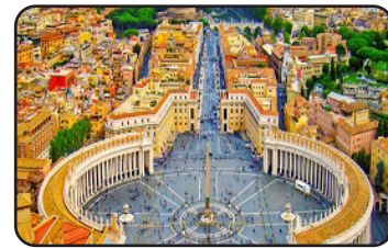
St Peter's Square